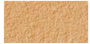
Sonora Sand Texture