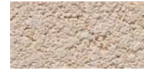
Fine Texture Trowel